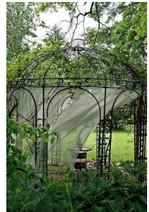
Design concept for pergola

Phase 1 of the Community Hall landscaping project began with raised gardens immediately behind the auditorium that were completed in 2019. As a continuation of Phase 1 of this project, at its July meeting, Council approved a design concept for a pergola to be installed between the two gardens. The design concept is for a wrought iron open roof design that would be ideal for weddings and wedding photos. The pergola, that will fit well into the natural landscape, will not shade the garden plants and will allow plants to train on the structure. A local artisan will be commissioned to construct the pergola that will be made of 85% recycled material. To the left is a photo of the Community Hall landscaping where the pergola will be placed.