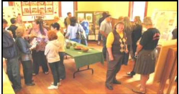
Highlands Community Green Map Celebration—June 21, 2009