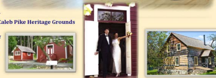
Caleb Pike Heritage Grounds

With floor to ceiling windows overlooking a natural wetland ecosystem, the Community Hall offers a 1200 square foot assembly area which can seat up to 100 people at tables, 112 theatre type seating, and 72 conference type seating. The warming kitchen comes equipped with coffee and tea service, and full dinnerware for up to 50 people. The stage area is visually beautiful and acoustically designed.