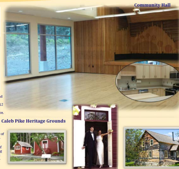
Caleb Pike Heritage Grounds

Rental prices include set up of table and chairs, and lighting of the wood-stove in the Caleb Pike House. Renters need to bring any items such as flip charts or slide-projectors. A high speed ADSL wireless internet connection is available in the Schoolhouse.