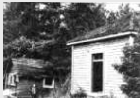
Deteriorated School House & Teacherage