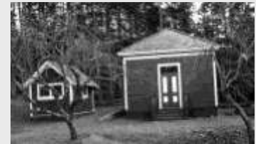
School House & Teacherage today