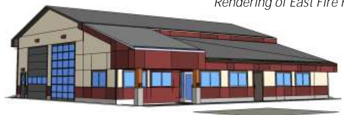
Rendering of East Fire Hall

Replacement of the east fire hall is well underway, with lock up planned for November and final completion for April 2015.