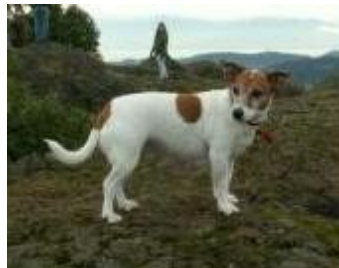
Stella (L) and Maulie (above) are missing in Highlands. Their owners search for them daily, aided by FLED, a local agency formed to help reunite lost or escaped dogs with their owners.

If you have seen either of these dogs, please contact FLED , <fledsearch.wordpress.com>. Bookmark this page, visit often, and use it to contact the volunteer members of the organization should you ever find or lose a dog. Volunteers to help search are welcome - details can be found on the website.