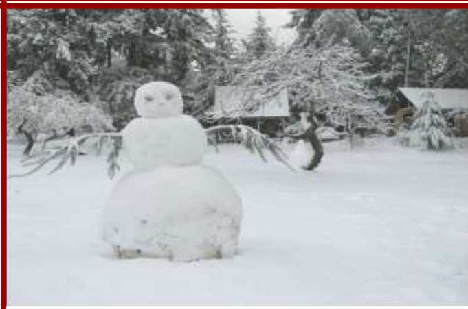
A snowman greets those who braved the winter weather to attend the Sustainability Fair November 20th.

A MESSAGE FROM THE FIRE DEPARTMENT Last month we moved our clocks back one hour, and the Fire Chief would like to remind residents this is a good time to change the batteries in your smoke alarms so they work properly when needed.