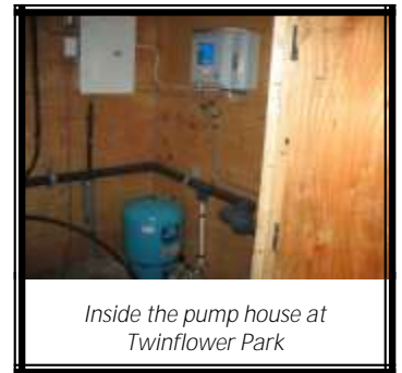
Inside the pump house at Twinflower Park

MOUNT WORK REGIONAL PARK MUNN ROAD PARKING LOT IMPROVEMENTS CRD Regional Parks staff will present final plans for the Mount Work Munn Road parking lot upgrades to the District of Highlands Council on Monday, August 17th. For more information visit : http://www.crd.bc.ca/parks/mountwork/